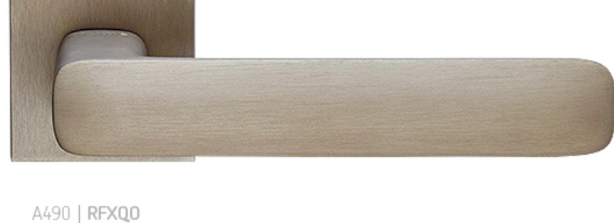
A490 | RFXQO