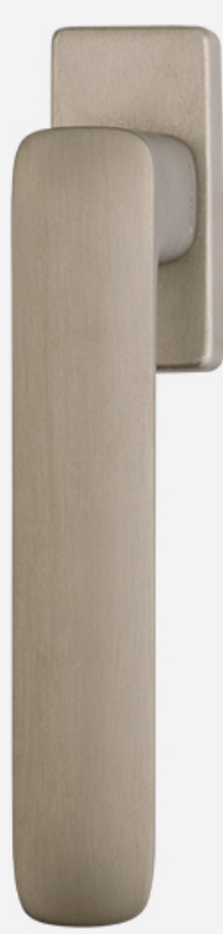
D490 | RRD