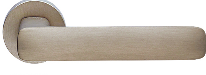
A490 | RFXTO