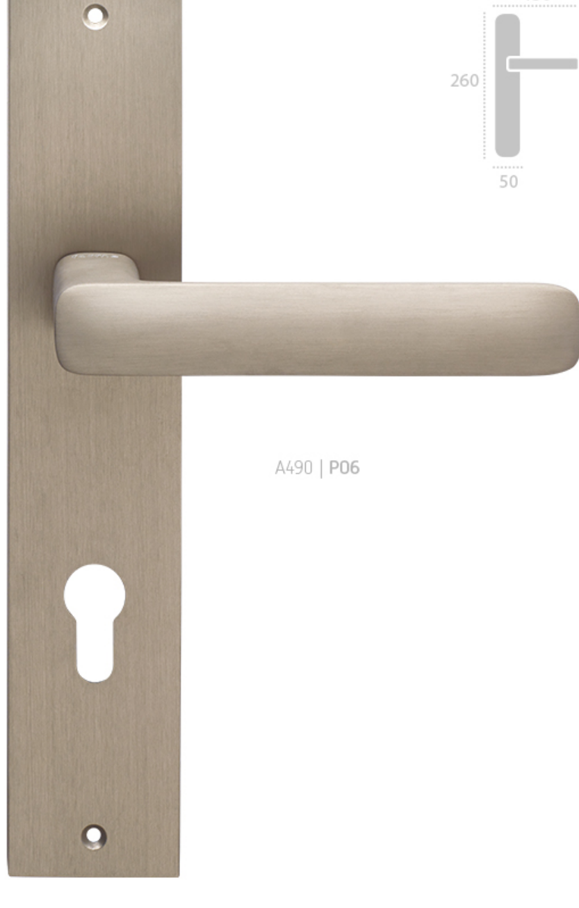
A490 | P06